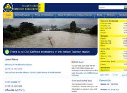
A snapshot of the home page of the new Civil Defence website.

they need. The new site will enable us to focus and target our communications to the public during any event."