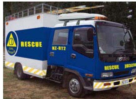
The Response team's new Big Emergency Rescue Truck - or BERT.

The vehicle is able to travel comfortably at 90 km/hr so the response team are looking forward to arriving at emergency scenes before the media!